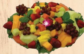
FRUIT PLATTER CUT 9 INGRD.(SERVE 14-18) 91855 1/PLATTER