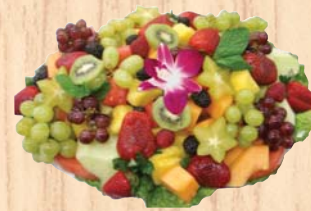
FRUIT CUT PLATTER 12 INGRD(SERVES 18/22) 91825 1/PLATTER