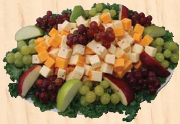
CHEESE PLATTER FRESH (SERVES 13-17) 91805 1/PLATTER

*** TO ENSURE NEXT DAY DELIVERY, ORDERS MUST BE PLACED AND IN THE COMPUTER BY 12 NOON ***