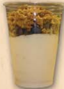
Strawberry Parfait w/Vanilla Yogurt 92080 12/9 oz