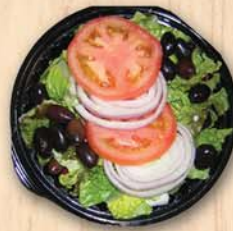
Mediterranean Salad Bowl 71440 6/11oz