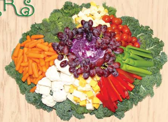
Crudite and Cheese Platter 1/11lb 91820