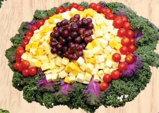
Large Cheese Platter 1/10lb 92010