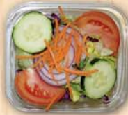
Small Tossed Salad 92095 12/6oz