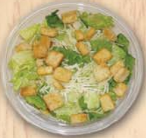
Ceasar Salad Bowl 92096 12/6oz