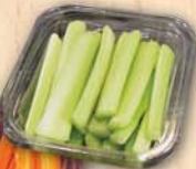
Celery Stick Cup 90795 12/6oz