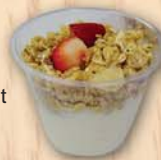
Petite Parfaits w/Vanilla Yogurt 12/6 oz Blueberry 92086 Strawberry 92081