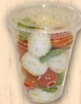
Mozzarella & Tomato Salad 90793 12/9 oz