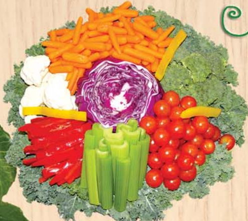
Crudite Basket 1/5.5lb 91810