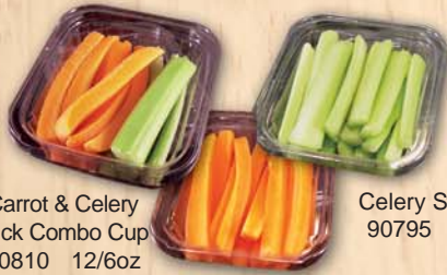
Carrot & Celery Stick Combo Cup 90810 12/6oz