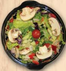
Garden Salad Bowl 71435 6/11oz