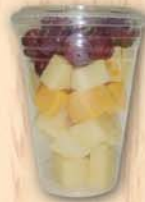
Cheese & Grape Cup 71426 12/9 oz