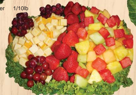
Fruit & Cheese Basket 1/10lb 57126