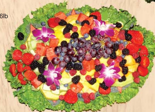
Large Fruit Basket 1/10lb 91825