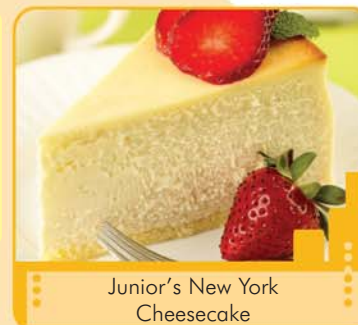
Junior's New York Cheesecake