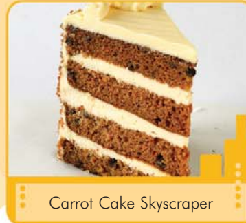
Carrot Cake Skyscraper