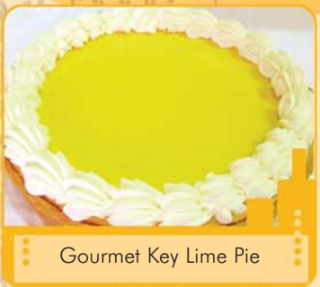
Gourmet Key Lime Pie