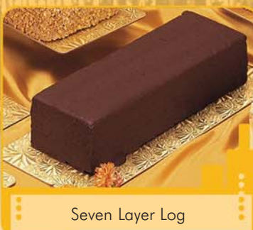
Seven Layer Log