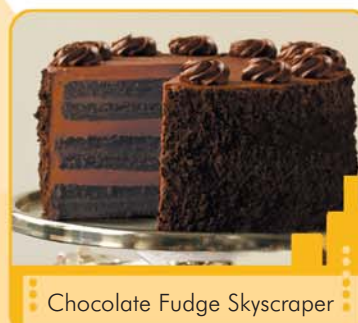
Chocolate Fudge Skyscraper