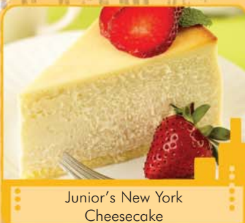
Junior's New York Cheesecake