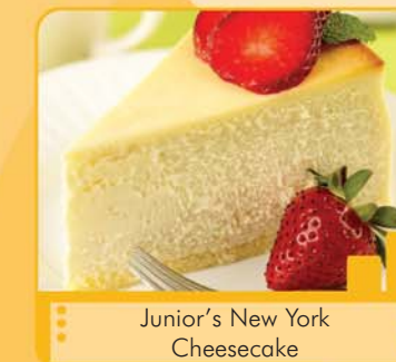
Junior's New York Cheesecake