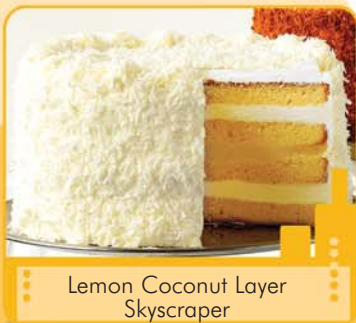
Lemon Coconut Layer Skyscraper