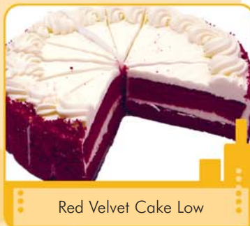
Red Velvet Cake Low

GREAT FOR: High End Steak Restaurants, Dessert for Two