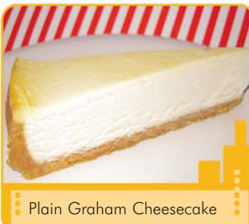
Plain Graham Cheesecake