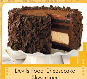
Devils Food Cheesecake Skyscraper