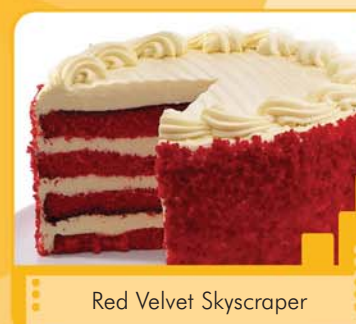
Red Velvet Skyscraper

GREAT FOR: High End Steak Restaurants, Dessert for Two