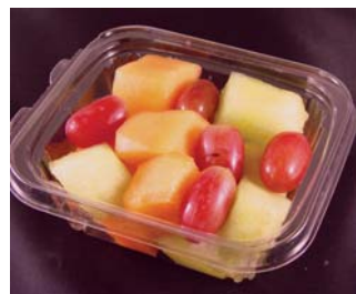
Fruit Salad, cut