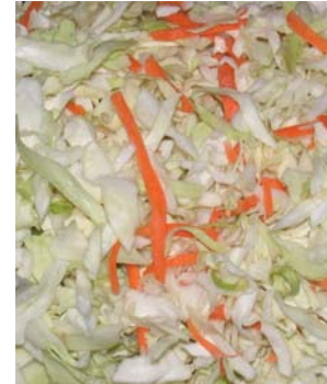
Shredded Cabbage with Carrots