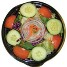
Tossed Salad Bowl 71425 6/10oz