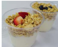
Petite Parfaits w/Vanilla Yogurt 12/6 oz Blueberry 92086 Strawberry 92081

J. Kings Food Service Professionals, Inc. 700 Furrows Road • Holtsville, NY 11742 631-289-8401