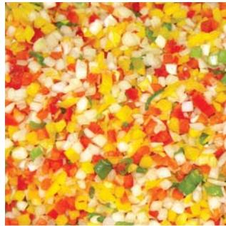
Santa Fe Blend