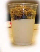
Blueberry Parfait w/Vanilla Yogurt 92085 12/9 oz