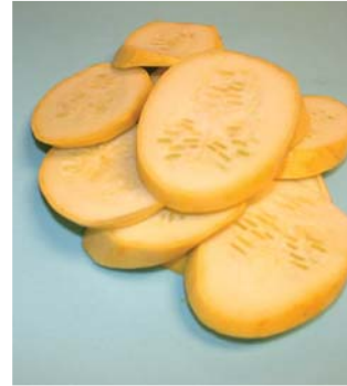
Yellow Squash, bias cut