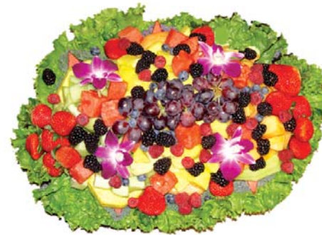
Large Fruit Basket 1/10lb 91825