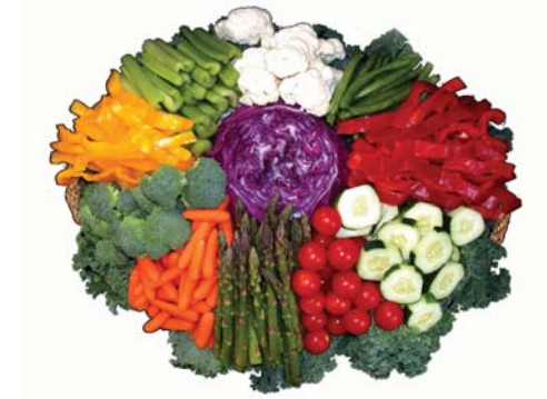
Large Crudite Basket 1/9lb 91830