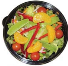
Asian Salad Bowl 71430 6/11oz