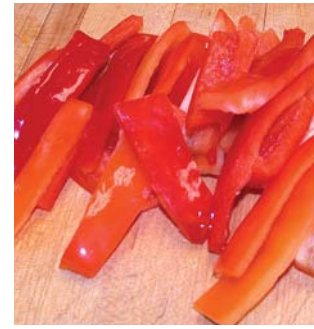
Red Pepper Sticks