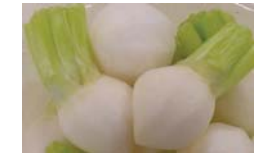
Turnip, Baby Peeled w/Top