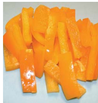
Yellow Pepper Sticks