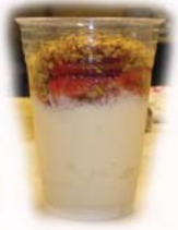
Strawberry Parfait w/Vanilla Yogurt 92080 12/9 oz