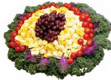
Large Cheese Platter 1/10lb 92010