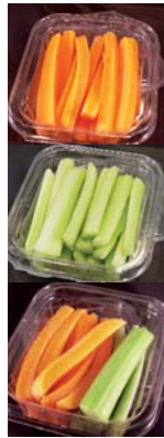
Carrot Stick Cup 90790 12/6oz