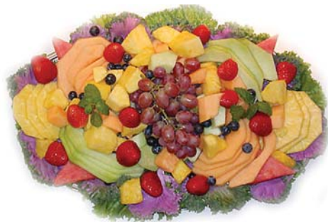
Fruit Platter, Sliced Oval 1/6lb 91855