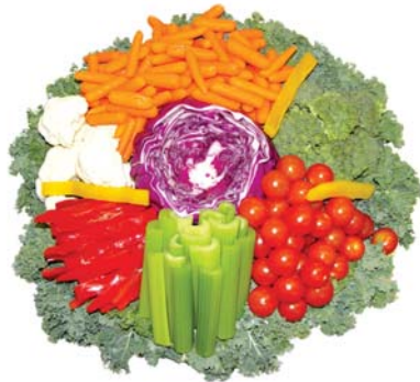
Crudite Basket 1/5.5lb 91810