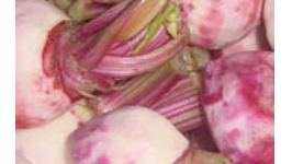
Beet - Candy Stripe, Baby Peeled