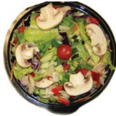
Garden Salad Bowl 71435 6/11oz