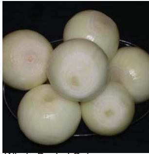
Whole Peeled Onions