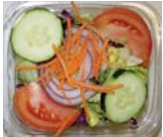
Small Tossed Salad 92095 12/6oz