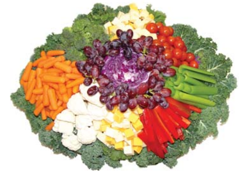
Crudite and Cheese Platter 1/11lb 91820