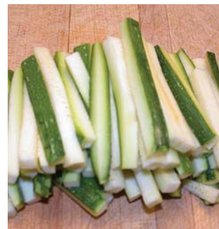
Green Squash Sticks