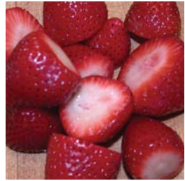
Strawberries, washed & topped