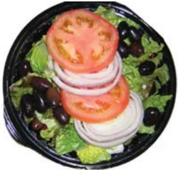
Mediterranean Salad Bowl 71440 6/11oz