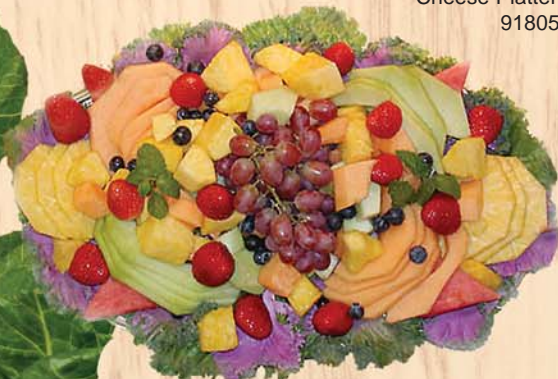
Fruit Platter, Sliced Oval 1/6lb 91855