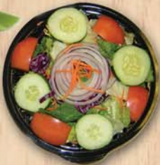
Tossed Salad Bowl 71425 6/10oz