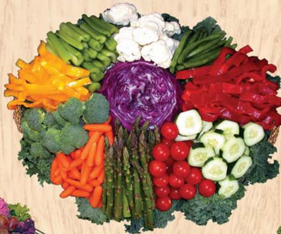
Large Crudite Basket 1/9lb 91830