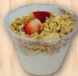
Petite Parfaits w/Vanilla Yogurt 12/6 oz 92086 Blueberry 92081 Strawberry