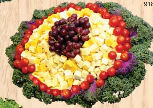
Large Cheese Platter 1/10lb 92010