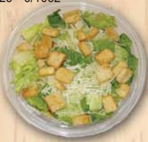
Caesar Salad Bowl 92096 12/6oz