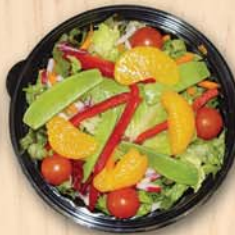
Asian Salad Bowl 71430 6/11oz