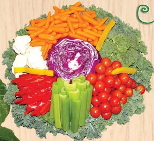
Crudite Basket 1/5.5lb 91810