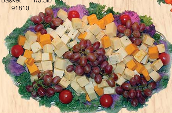
Cheese Platter 1/6lb 91805