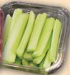
Celery Stick Cup 90795 12/6oz