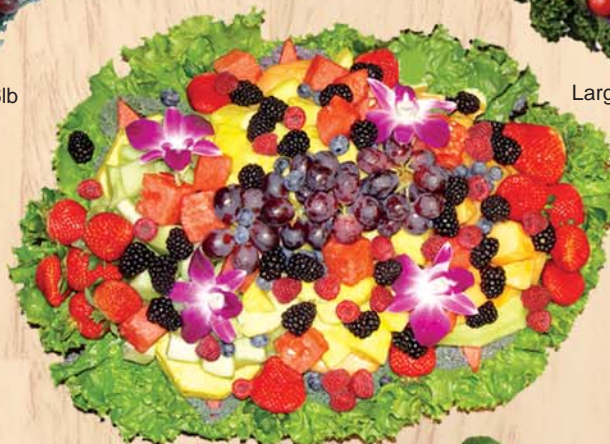
Large Fruit Basket 1/10lb 91825