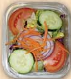
Small Tossed Salad 92095 12/6oz

MULTI-PACK Assorted Salad Case (4 Caesar, 4 Garden, 4 Greek) 92099 12/6oz