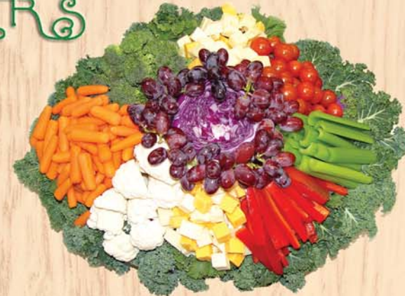
Crudite and Cheese Platter 1/10lb 91820