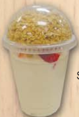
Strawberry Parfait w/Vanilla Yogurt 92080 12/9 oz