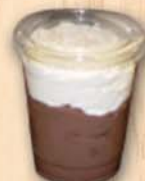
Chocolate Pudding 92083 12/10oz