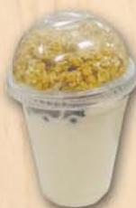
Blueberry Parfait w/Vanilla Yogurt 92085 12/9 oz