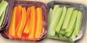
Carrot Stick Cup 90790 12/6oz