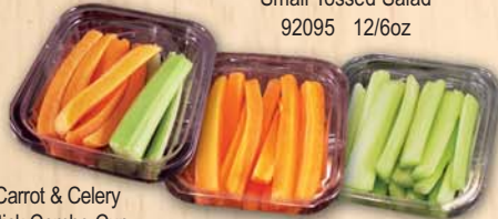
Carrot & Celery Stick Combo Cup 90810 12/6oz