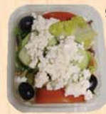
Small Greek Salad 92094 12/6oz