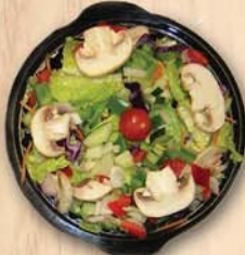
Garden Salad Bowl 71435 6/11oz