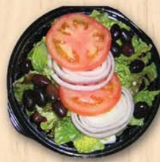
Mediterranean Salad Bowl 71440 6/11oz