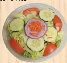
Garden Salad Bowl 92098 12/9oz