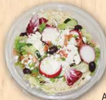
Greek Salad Bowl 92097 12/10oz

MULTI-PACK Assorted Salad Case (4 Caesar, 4 Garden, 4 Greek) 92099 12/6oz